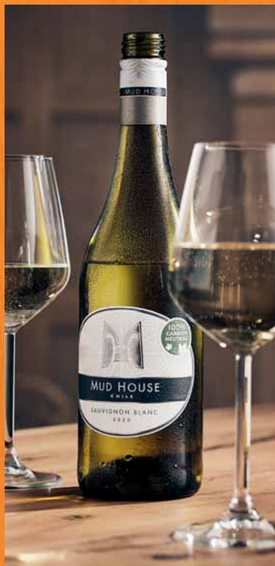
Mud House Sauvignon Blanc A perfect match with our Haddock and Chips

Jam Shed Shiraz and Captain Morgan Spiced Rum with Fever-Tree Ginger Ale and fresh lemon and orange wheels