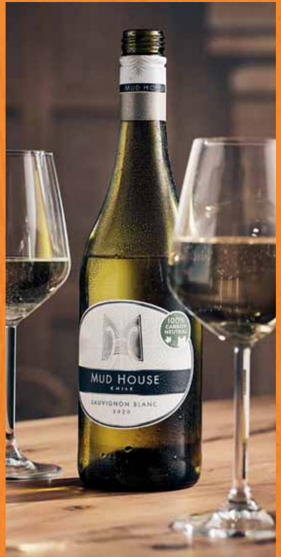
Mud House Sauvignon Blanc A perfect match with our Haddock and Chips

Finca del Alta Malbec | Argentina | alc 13.5% A good full rich smooth red